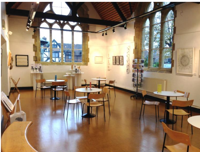
The Gallery exhibition space at Cranleigh Arts Centre